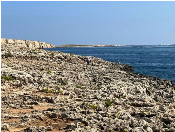
The craggy coast of St. Paul's Bay looking out to the island on which Paul is said to have been shipwrecked

We've arrived at Saint Paul's Bay, Malta . Sitting on the jagged coralline limestone of the mainland, we are looking across the bay to a small, uninhabited island that juts out of the Mediterranean which is thought to be where Paul's shipwreck occurred. In the nearby town by the water's edge is St Paul's Shipwreck Church, or St Paul's Bonfire Church as it is sometimes called, that was built in the 14th century at the traditional site where the survivors came ashore and where a bonfire was built for them.